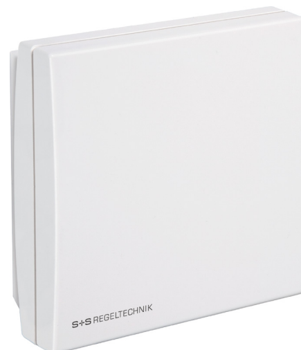
Fig. 1: Room temperature sensor

The temperature sensor is intended for wall mounting and is equipped with a screw terminal connections. The temperature sensor CID370042 is designed for measuring the room temperature. The room temperature sensor is designed to replace the extract air temperature sensor inside the GLOBAL air handling unit. The room temperature sensor is used when the temperature in a room shall be given priority. It can also be used if there are temperature losses in the extract air duct up to the air handling unit's point of measurement. The measuring principle of the temperature sensor is based on an internal sensor that outputs a temperature-dependent resistance signal.